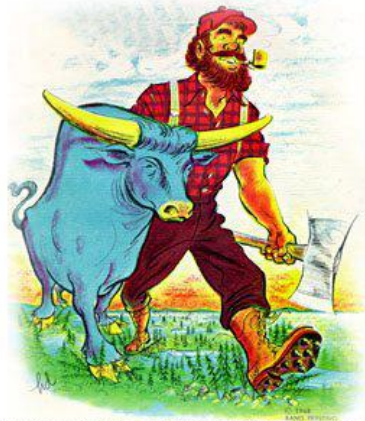
drawings by Homer Dimmick